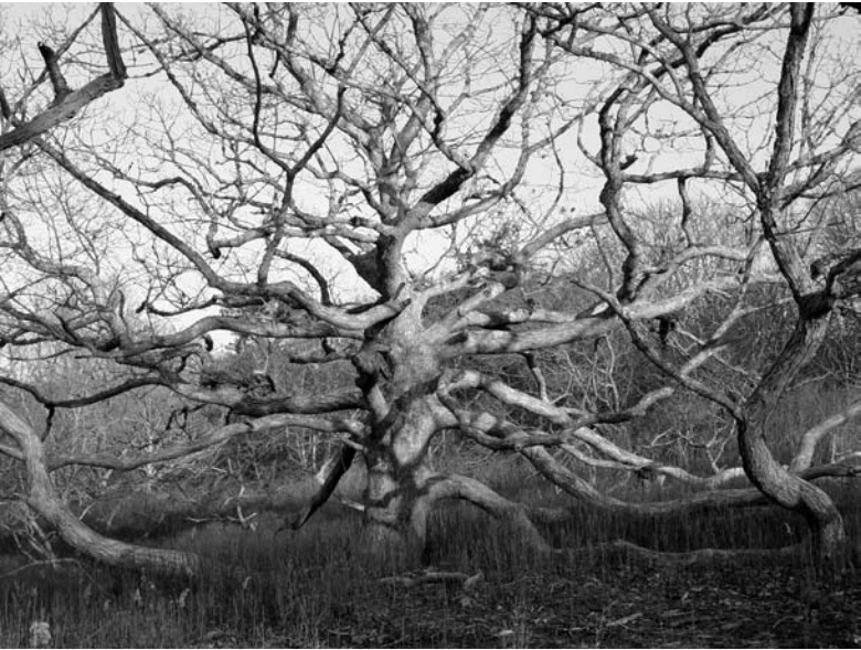
Figure 3. Wide-spreading Form of White Oak on Martha's Vineyard.