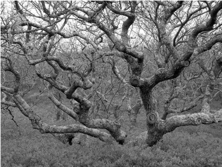
Figure 4. Wind-induced Spreading Form of Black Oak.