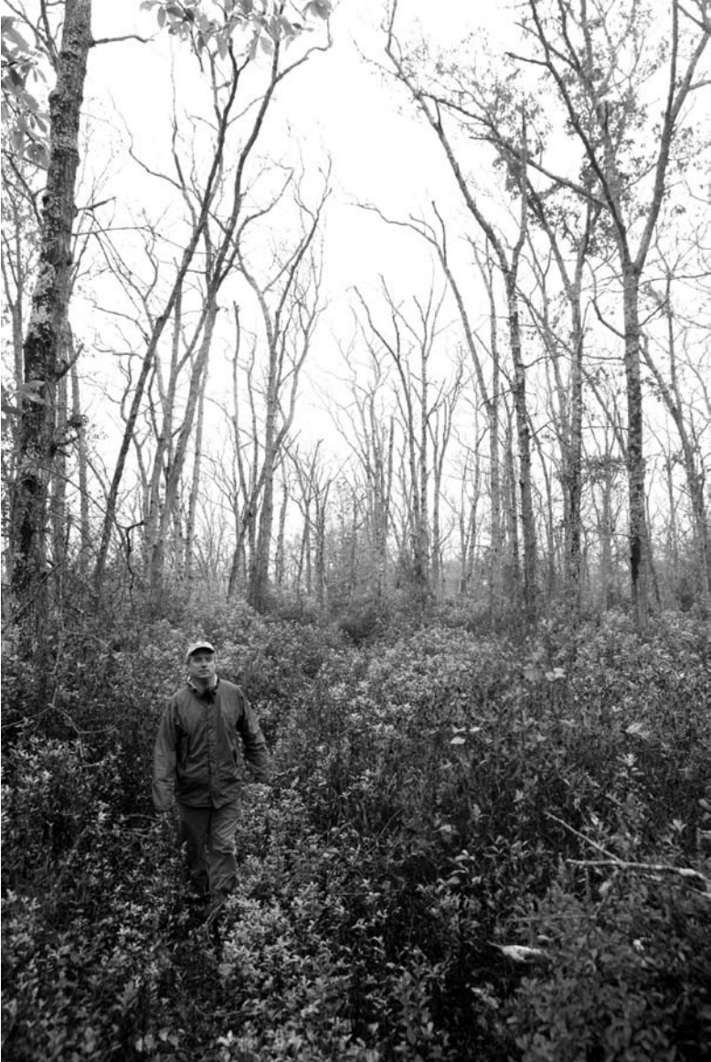
Figure 7. Author in the midst of oaks lost to fall cankerworm. Polly Hill Arboretum, 2009.