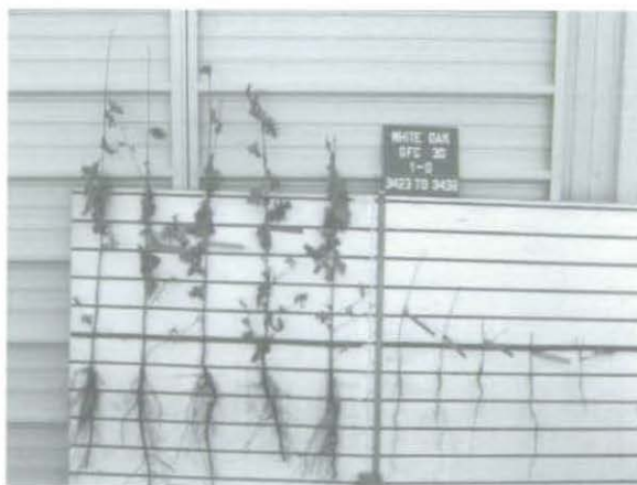
Figure 1. 1-0 Quercus alba seedlings grown with a nursery baseline fertility protocol in the southeastern US. Seedlings on the left of the meter stick were selected from the best 20% of a half-sib family, GFC-30. Seedlings on the right of the meter stick were selected from the poorest 50% of the same family.

When consistent seedling production meeting the desired standards was achieved, a biologically-based seedling grading system was developed using FOLR numbers similar to that used earlier for loblolly pine ( Pinus taeda L.) (Kormanik et al. 1990) and sweetgum ( Liquidambar styraciflua L.) (Kormanik 1986). Heritability estimates for FOLR numbers were as high as 0.898 and 0.918, with standard errors as low as 0.153 and 0.073 for NRO and WO, respectively (Kormanik et al. 1999). Seedlings with more FOLRs usually grow more in height and root-collar diameter than those with few or no FOLRs. Thus, we developed a minimum acceptable seedling morphological grading standard for outplanting in a forest situation. For both NRO and WO the standard is 6 FOLR, 8 mm root-collar diameter, and 0.75 m height. There is a significant difference in morphological development between the best 20% and the poorest 20% of the seedlings, even from among the best half-sibling (half-sib) progeny groups as shown in Figure 1. Usually about 40 to 60% of seedlings from most properly handled seedlots meet the specifications.