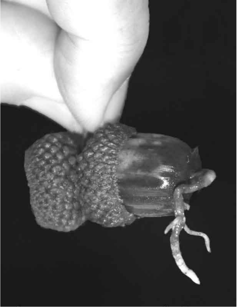
Quercus serrata ssp. mongolicoides