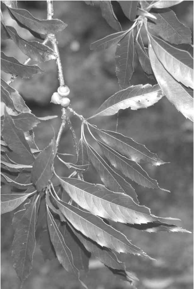
Quercus hondae Kitahara, Shikoku