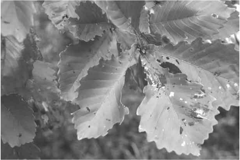
Quercus serrata ssp. mongolicoides