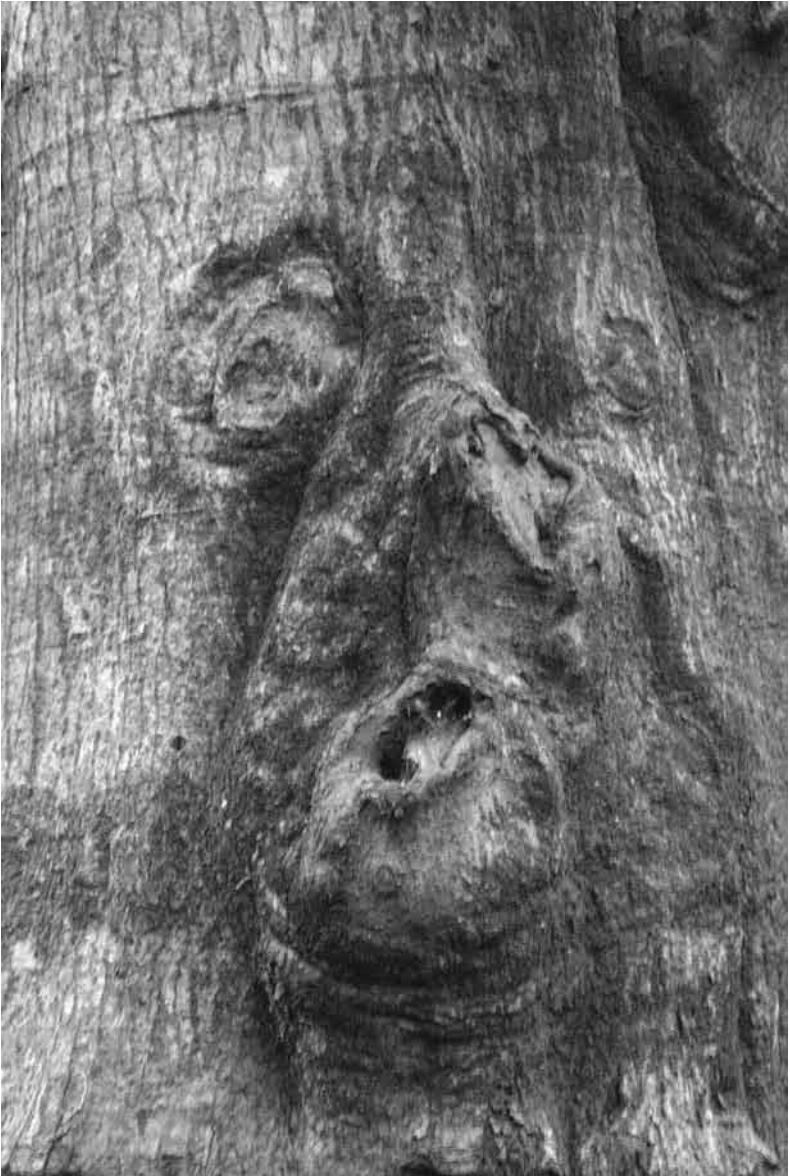
The true face of Quercus gilva