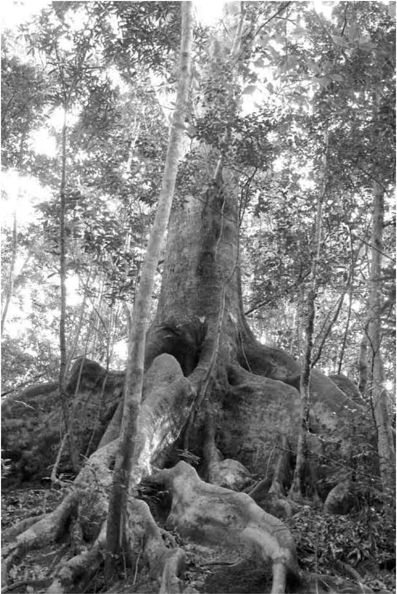
Quercus miyagii base, Amami Oshima