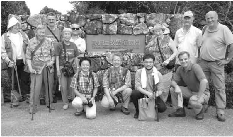
Entrance to the Makino Botanic Gardens, Kocki