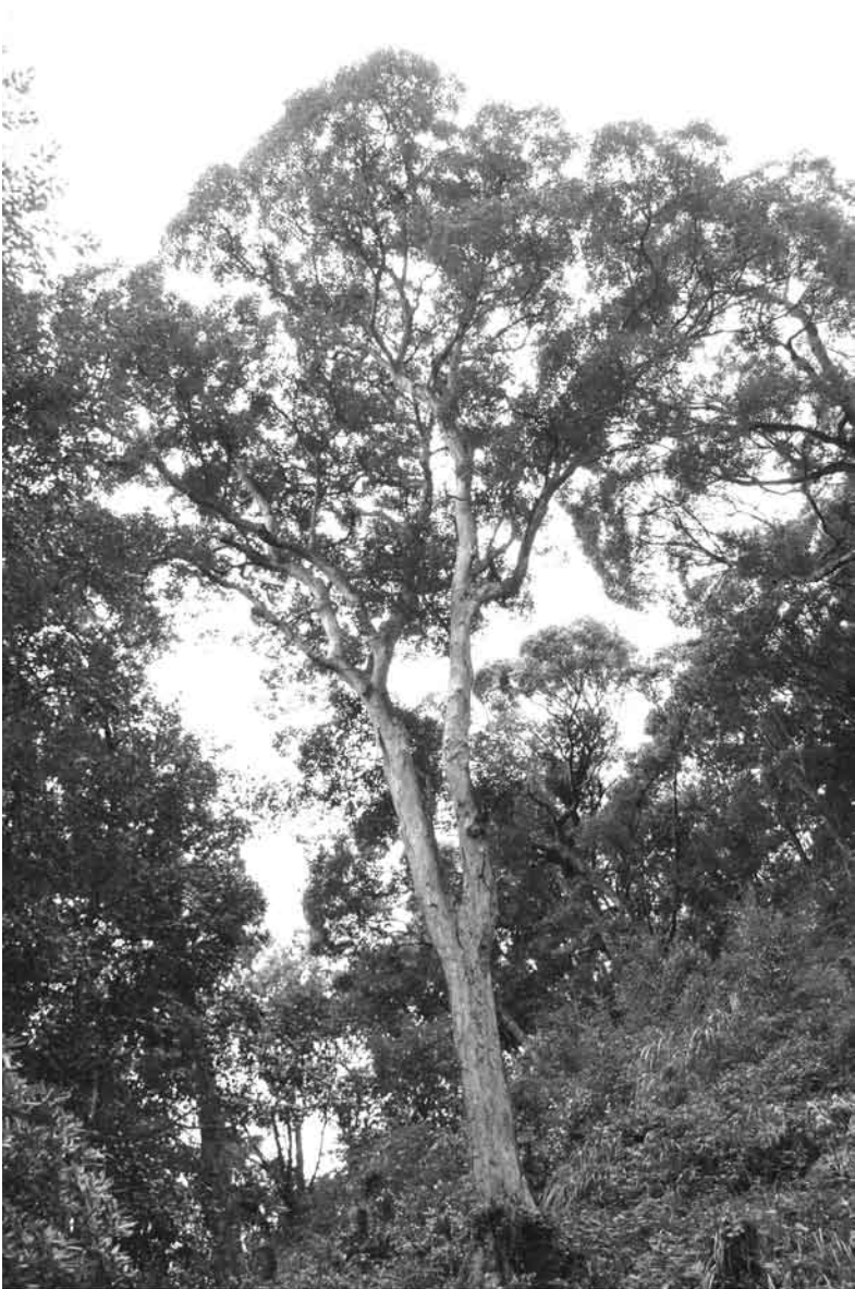
Quercus gilva near Kochi