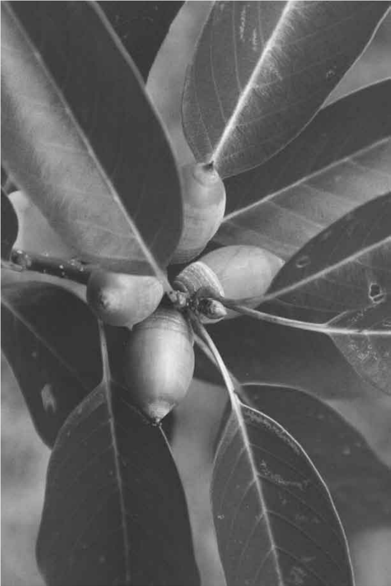
Quercus glauca var. amamiana , Amami Oshima