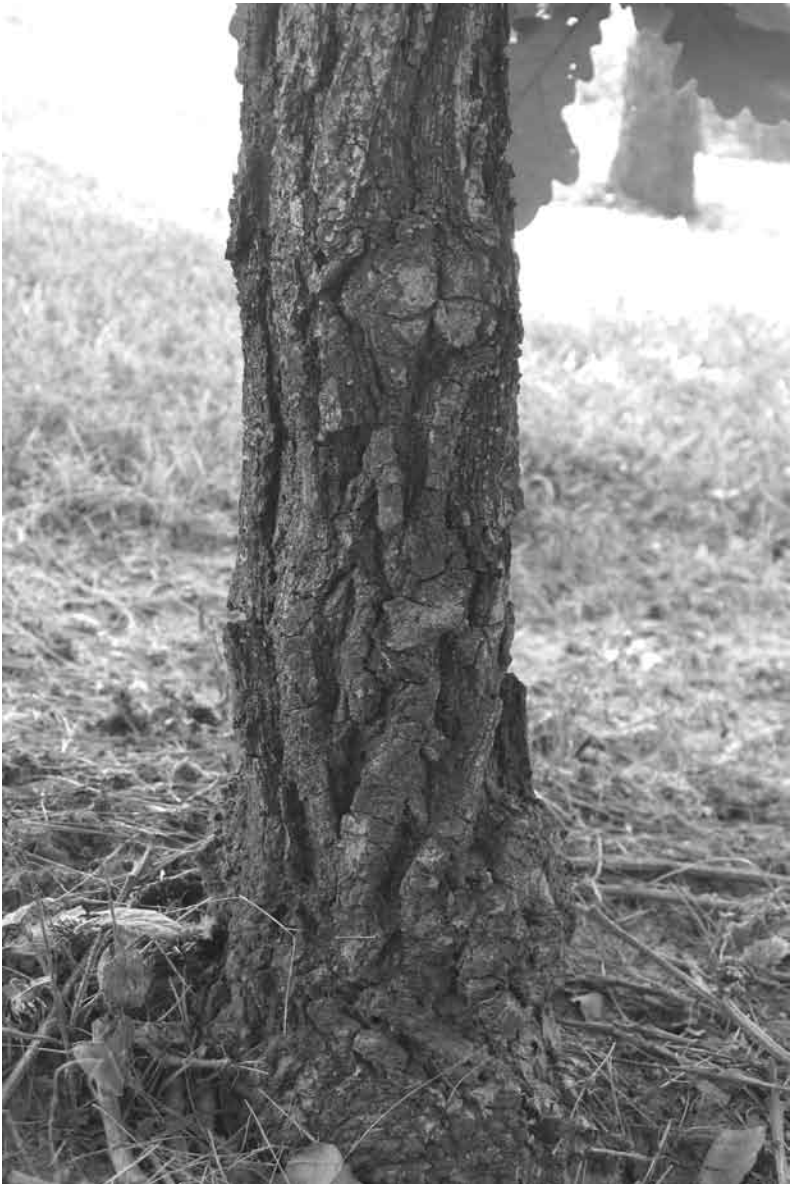
Bark on a young tree at Starhill Forest Arboretum