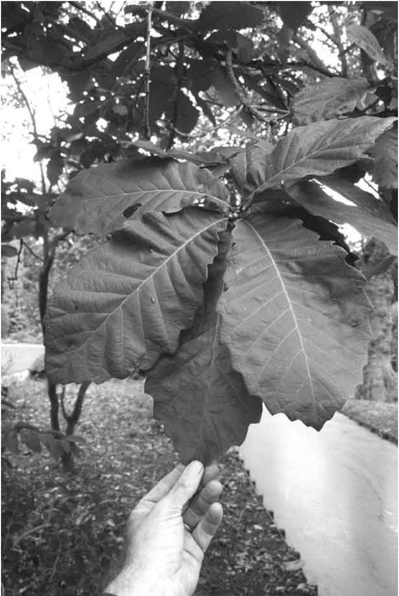
Foliage of 'Pondaim', a cross with Quercus pontica , at Arboretum Trompenburg