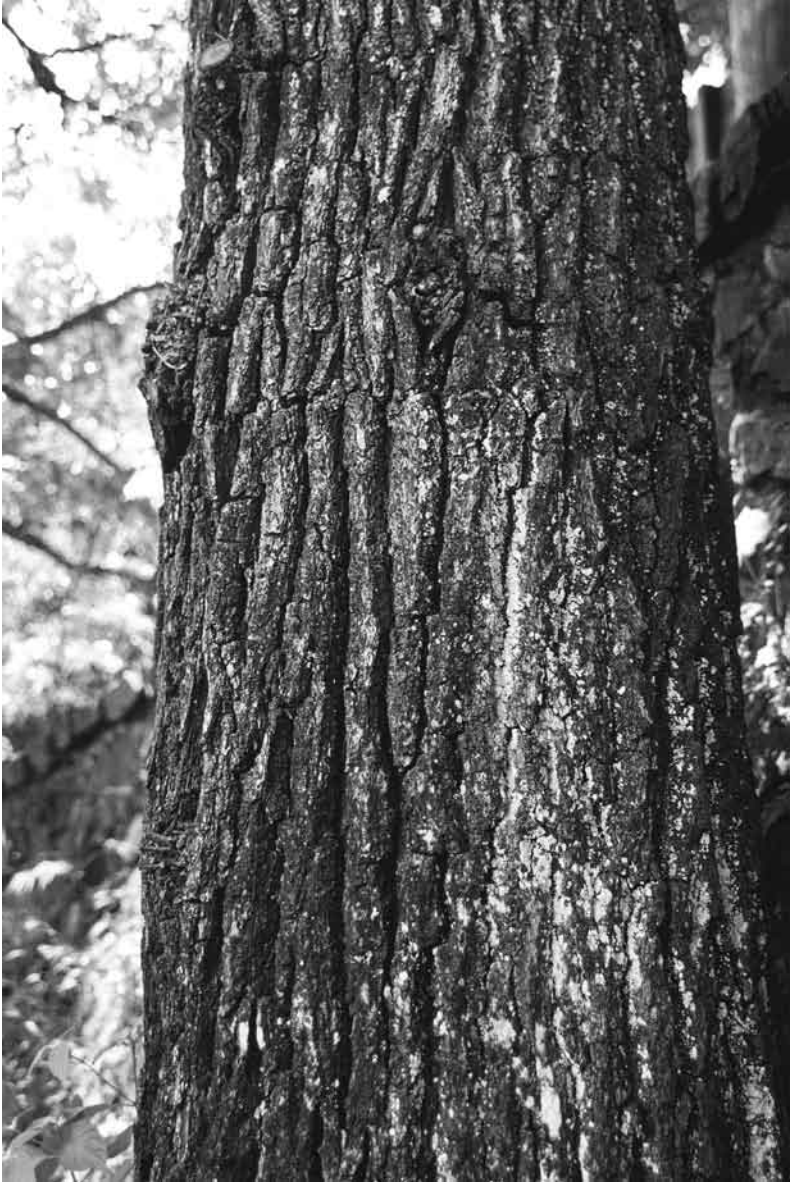
Bark of a mature tree in the wild in Japan