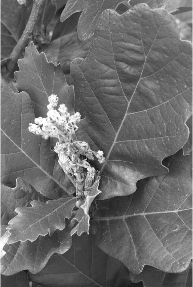
Fertile second growth flush