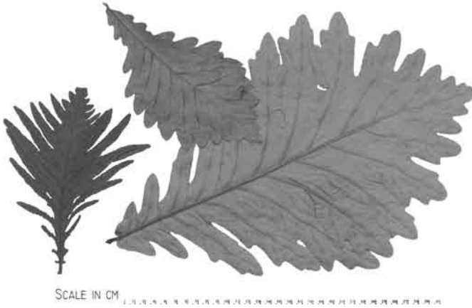
Leaf variation from three trees