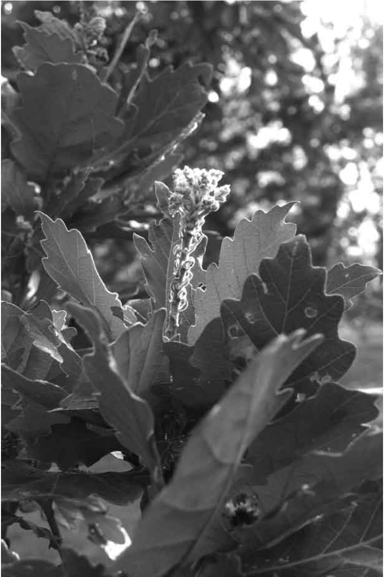
Fertile second growth flush