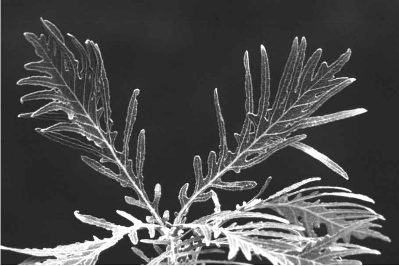
Quercus dentata 'Pinnatifida' at Starhill Forest Arboretum