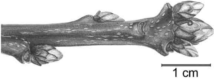
Q. dentata twigs and buds