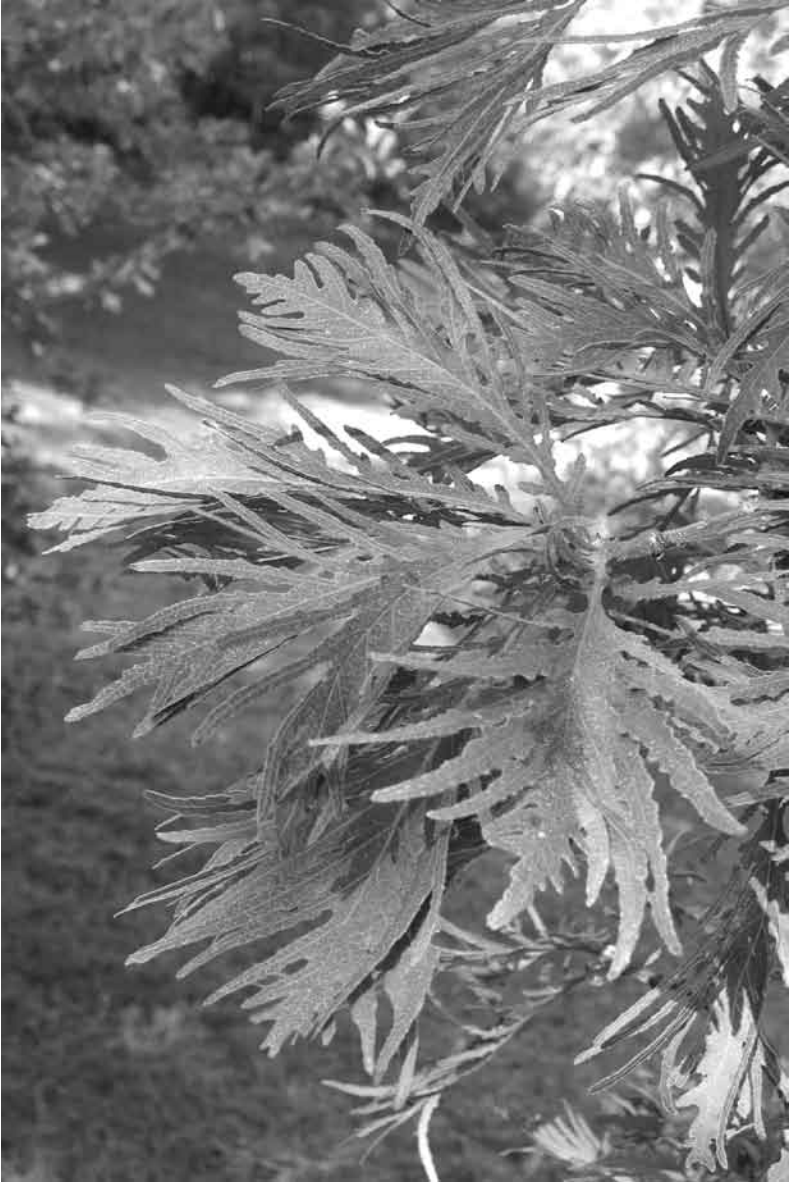
Quercus dentata 'Pinnatifida' at Starhill Forest Arboretum