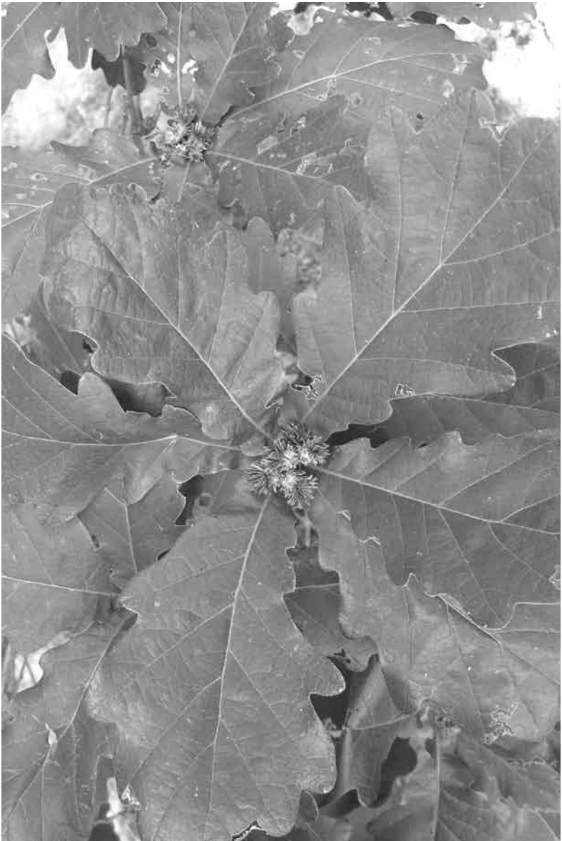
Foliage from a tree of Chinese origin at Starhill Forest Arboretum