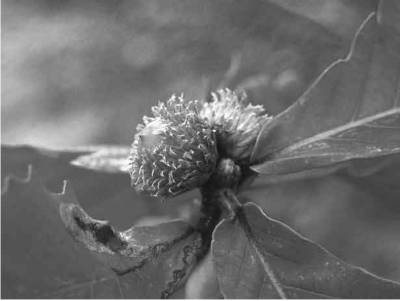
Ripe acorns ready for planting