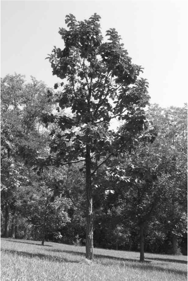
A young tree of Korean origin at Starhill Forest Arboretum