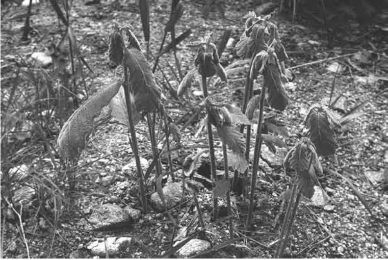
Young seedlings in the forest in Korea