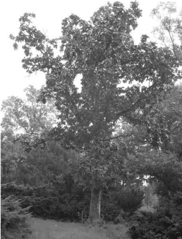
A large, erect tree at Gimborn Arboretum