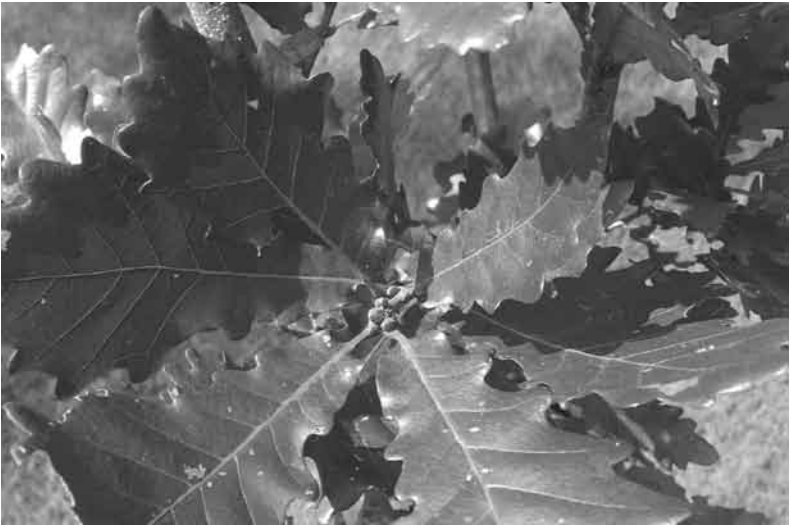
Quercus xvilmoriniana , a rare hybrid pollinated by Q. petraea , at Starhill Forest Arboretum (grafted from the ortet at Arboretum des Barres in France)