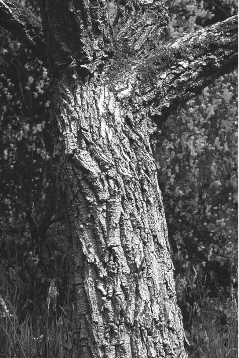
Bark on a medium-sized tree at the Hillier Arboretum