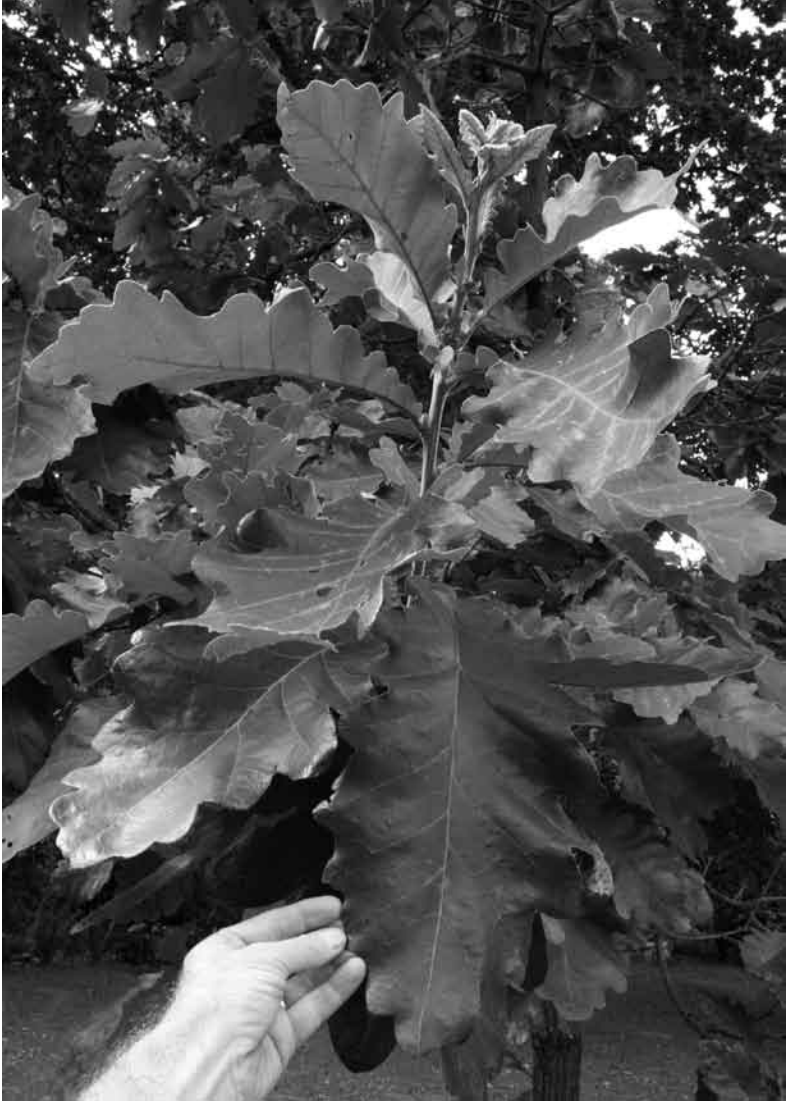
Leaves on Quercus dentata 'Sir Harold Hillier' at Arboretum Trompenburg