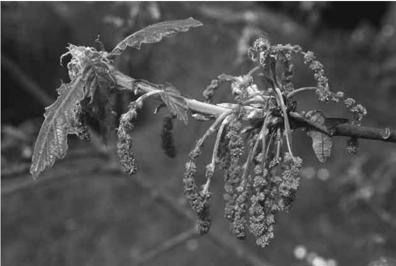
Staminate catkins expanding