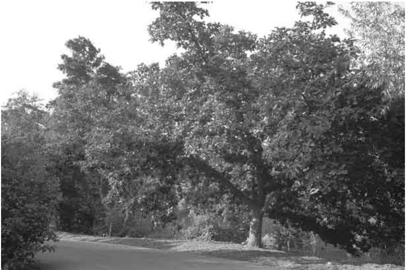
An old planted tree in the Los Angeles County Arboretum