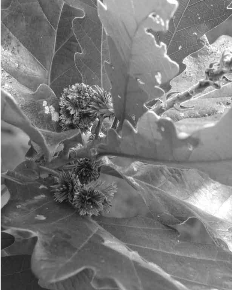
Q. dentata acorns developing