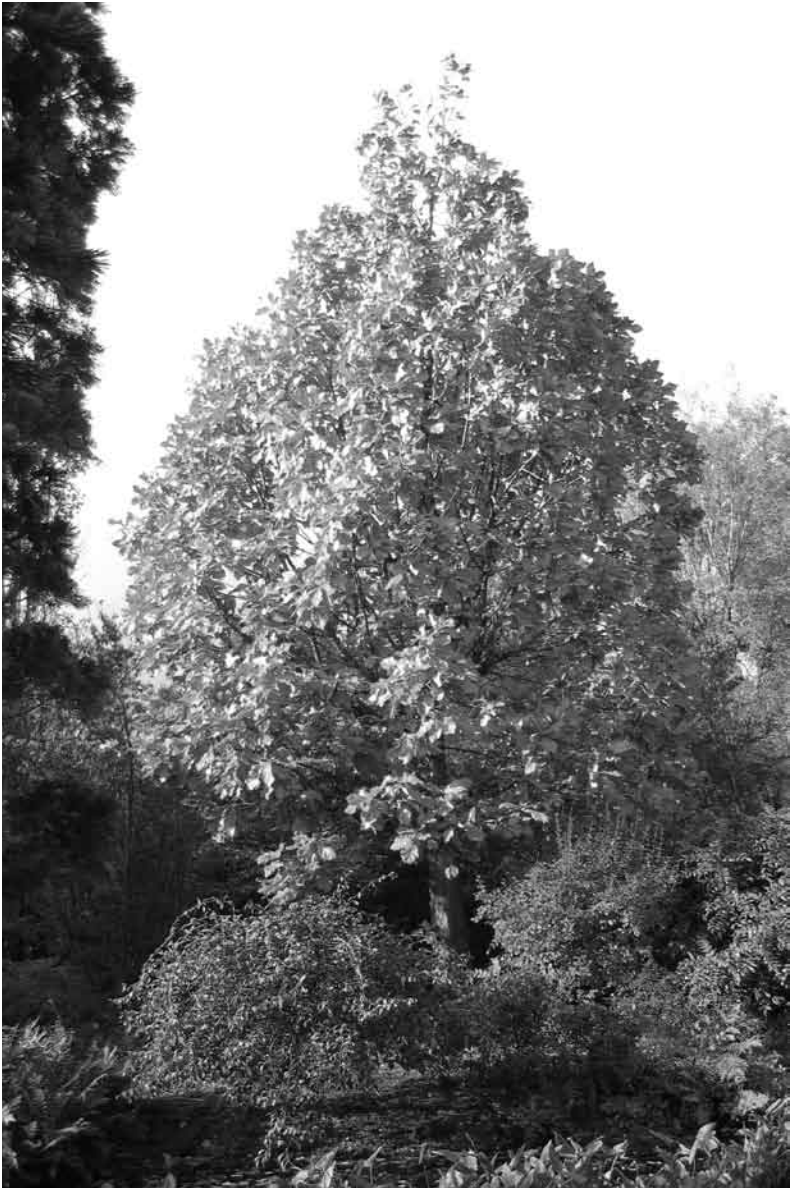
‘Pondaim’, a cross with Quercus pontica , at Arboretum Trompenburg