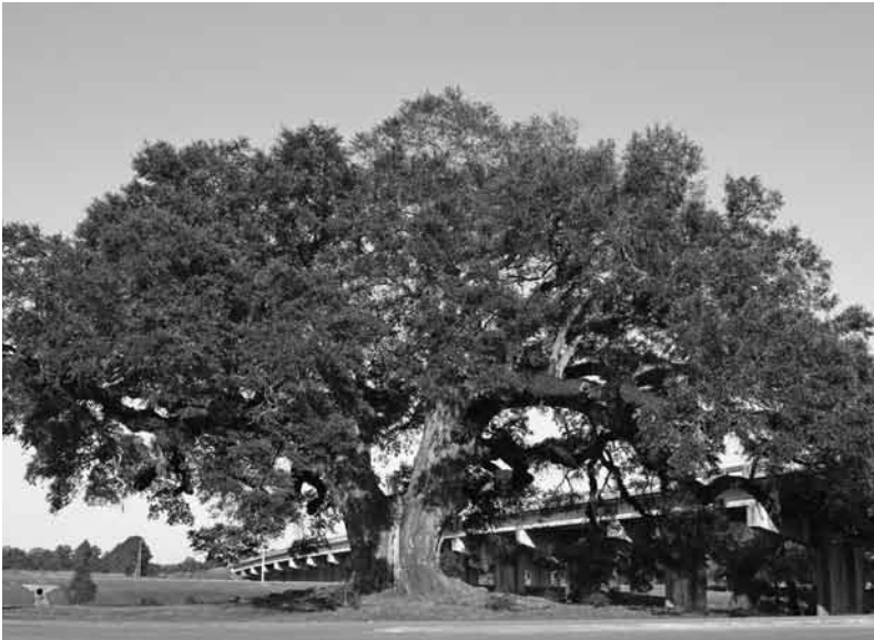
Gross tete oak