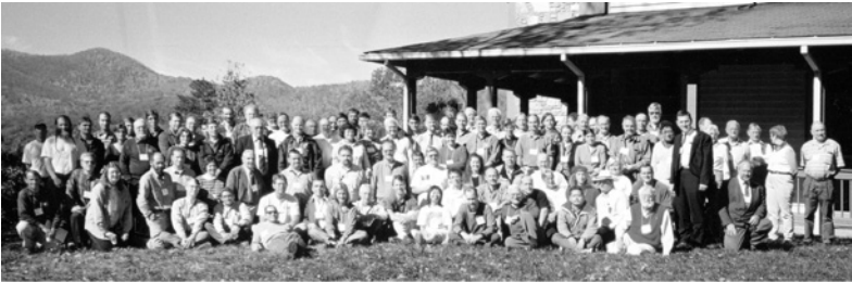
The First Full-Conference Group Photo 2000 - Asheville, North Carolina