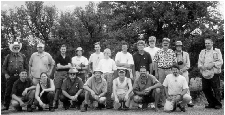
The First IOS American Tour - New Mexico 2001