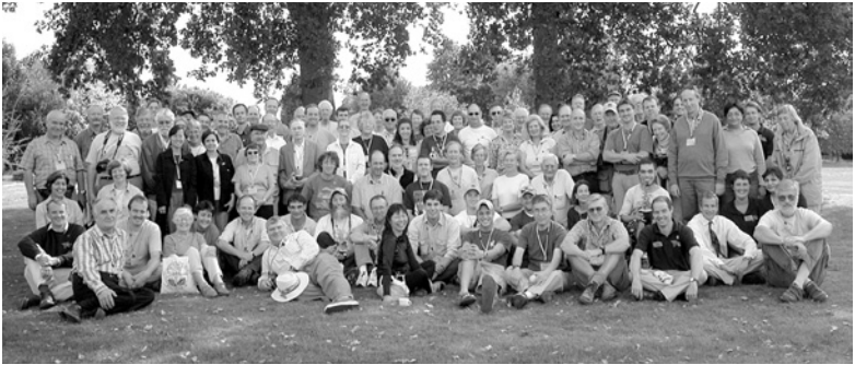
Fourth Triennial International Oak Conference Hampshire, United Kingdom, 2003