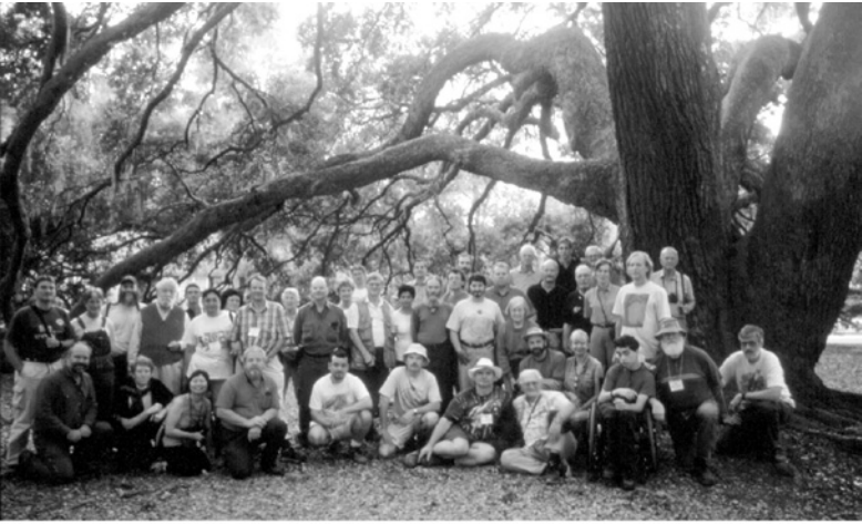
Field Trip - 2000 Conference Majestic Oak ( Q. virginiana ) - Savannah Georgia