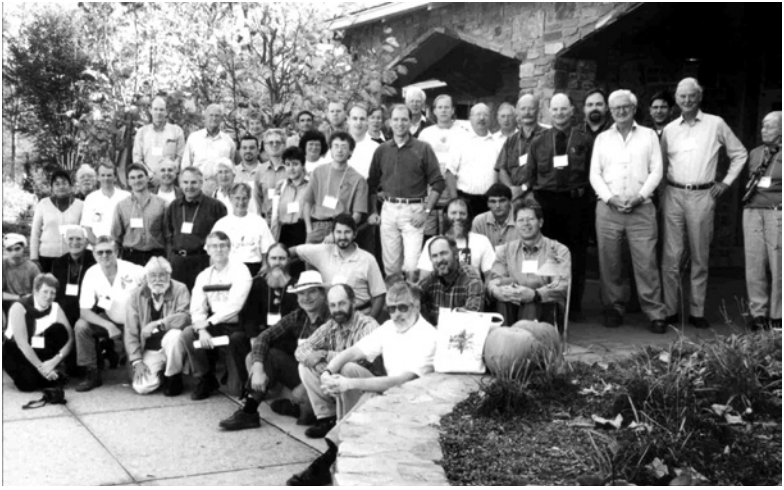
Third Members Meeting, IOS North Carolina 2000