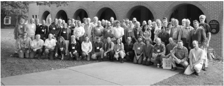
The Fifth Triennial Oak Conference Dallas, Texas 2006