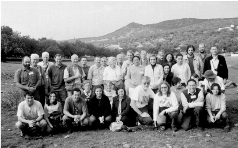
The First IOS European Tour - Spain 2001