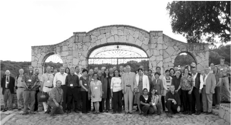
Sixth International Oak Conference Puebla, Mexico 2009