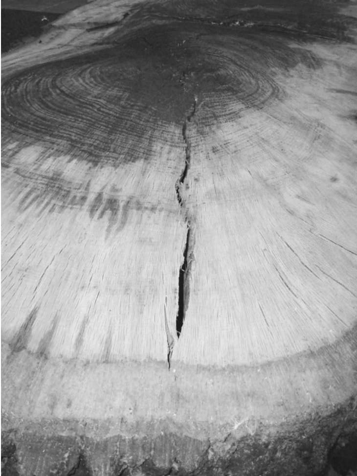
The slice has started to check, but not as badly as expected given 6 months of preparation and drying time.

We hope this enormous physical reminder will foster an ongoing ethic of tree preservation in our community. In this small way, the champion that never quite received its recognition will live on in the City of Trees forever.