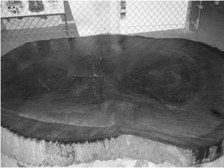
Tree Cookie, after one week in (3 June 2011)