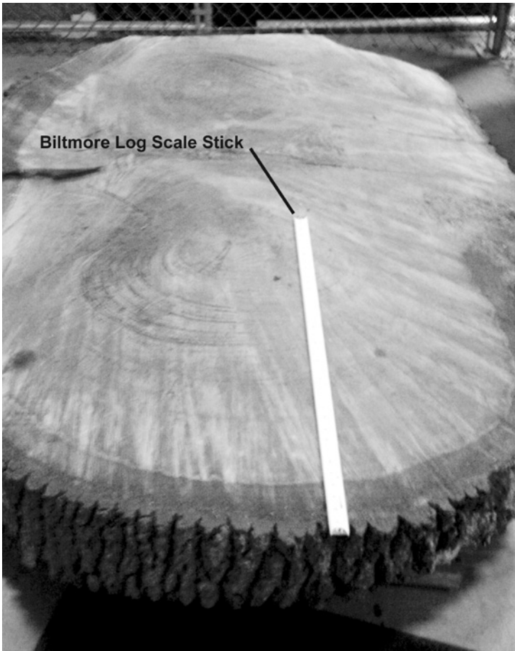
The tree cookie the next day. Biltmore stick for reference.

double doors. Luckily, our forklift driver was a pro and managed to swing it in sideways so it just barely fit. We placed the slab on wooden skids and then began the process of figuring out just what we had gotten ourselves into.