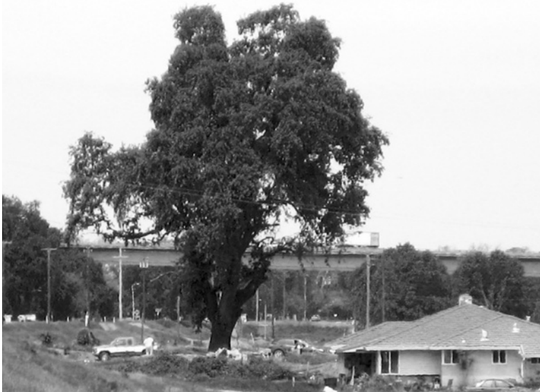
In the background behind the tree, Interstate 5 can be seen as it crosses the Sacramento River just north of downtown Sacramento CA.

the organization managing the levee project, the Tree Foundation found itself in a heartbreaking situation with no potential actions possible for preserving this very special tree. As almost an afterthought, Tree Foundation staff asked for a slice of this tree to be preserved during the removal process so that it could be shared with the community and used to educate people about how long it takes to establish magnificent trees and how quickly they can be erased from the landscape.