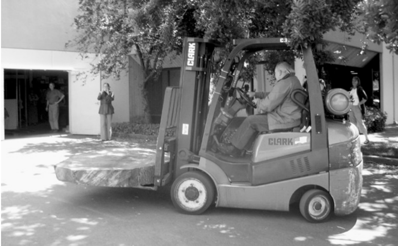
A man on his lunch break from a nearby lumber company warehouse helps us unload the slab and install it safely in our office.