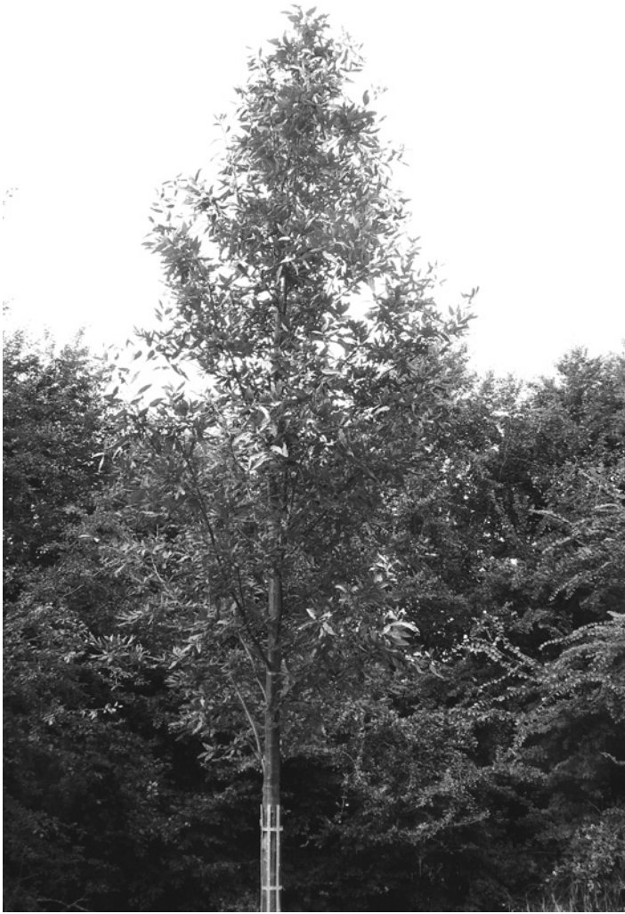
Quercus acutissima and truck protector