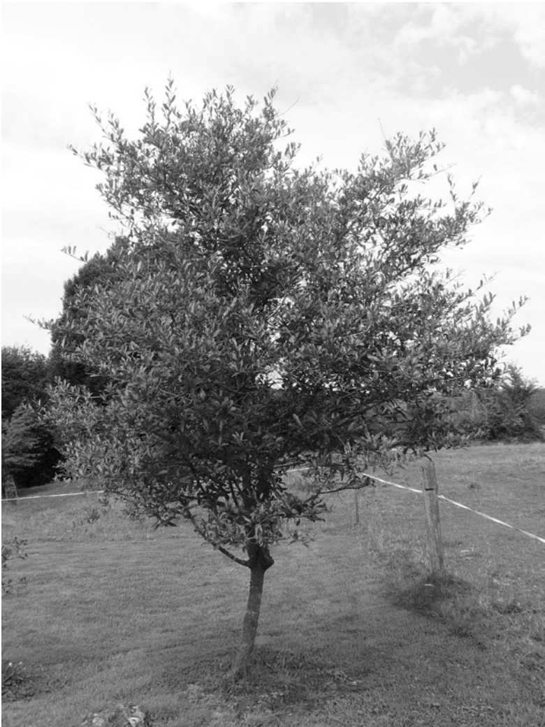
Quercus geminata and electric fence