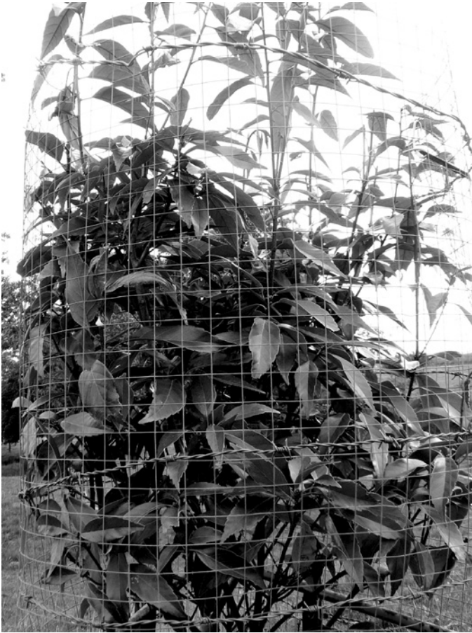
Quercus acuta with fencing