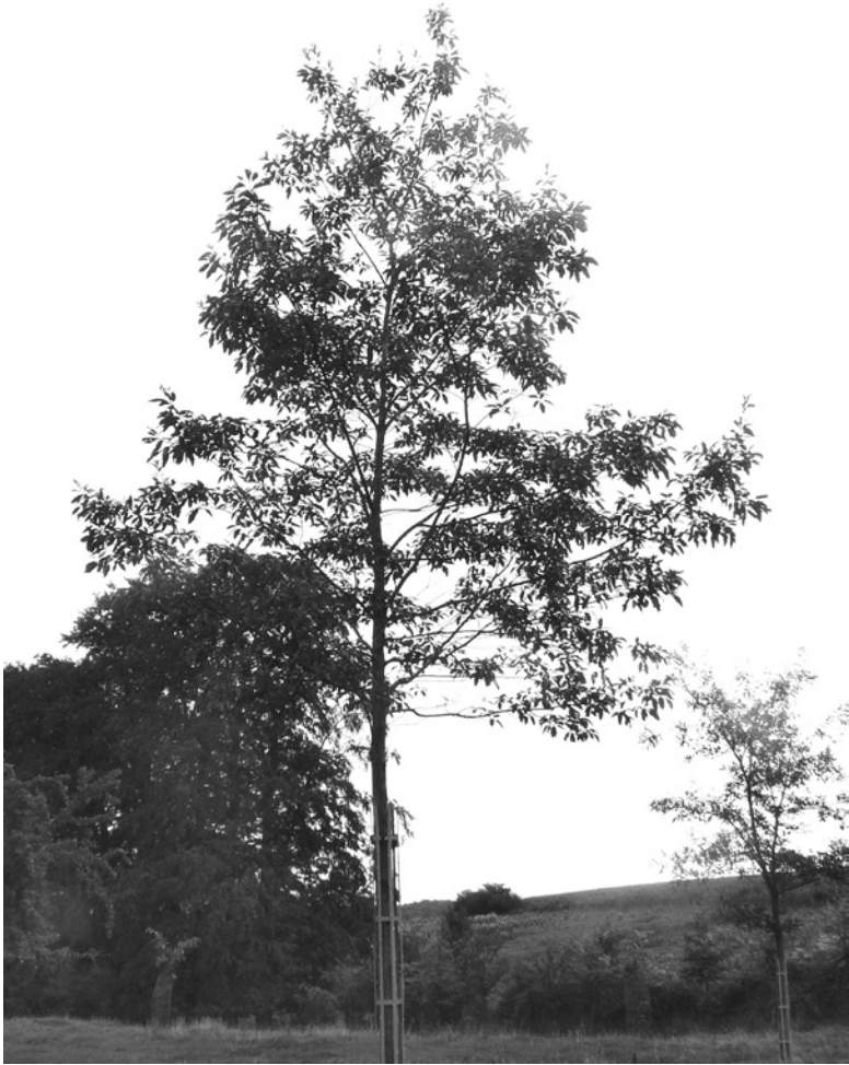
Quercus canbyi and truck protector