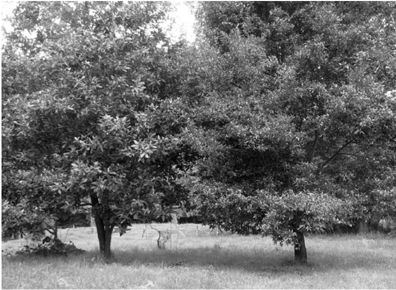
Quercus rysophylla and Quercus sartorii